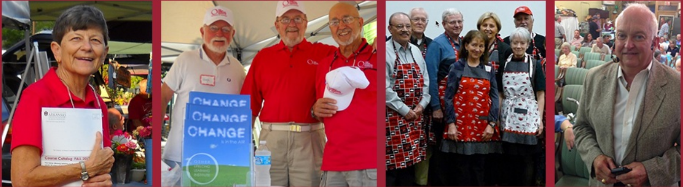
Welcome to Lifelong Learning!

The Osher Lifelong Learning Institute at U of A is Arkansas' leading university affiliated, non-profit program providing high quality, affordable educational, cultural and engagement opportunities for seasoned adults. Invest in Lifelong Learning. Join and you'll discover programs that capture your interest and fit your schedule, all year round.